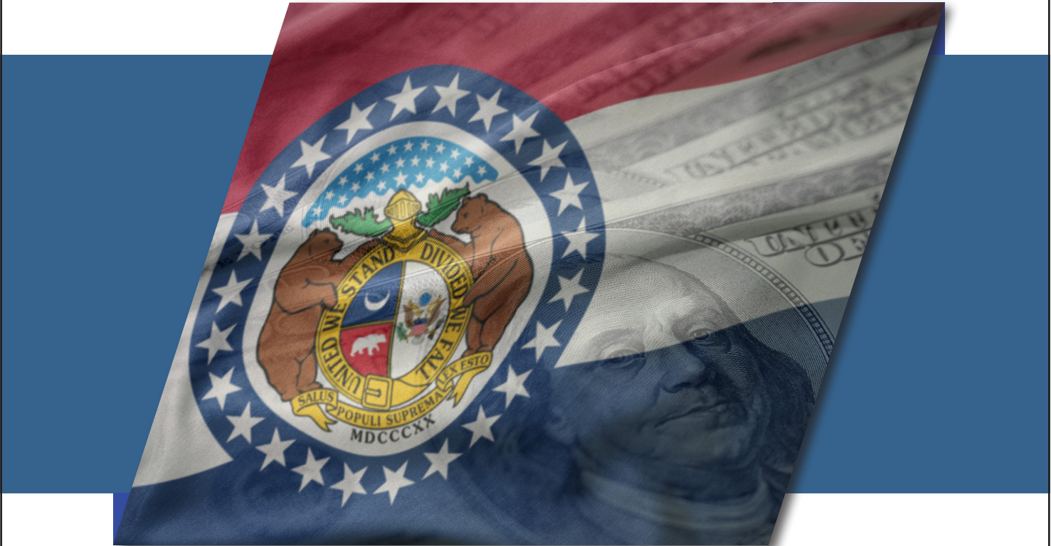
MoDOT & Patrol Employees' Retirement System FY 2023

MPERS Benefit Recipients & Covered Employees in Missouri